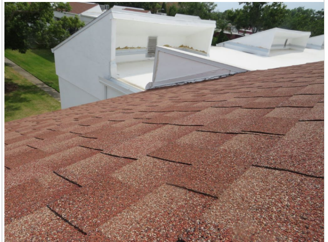
Mansard roof covering