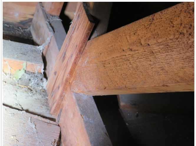
Roof to wall attachment toe nail