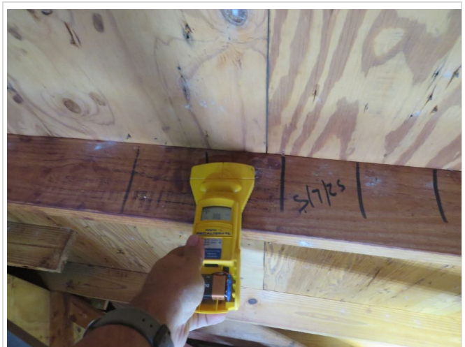
Nail detection device