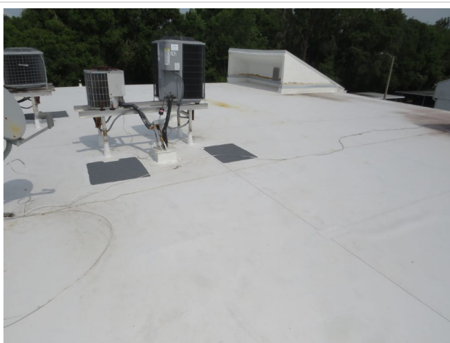
Roof covering TPO